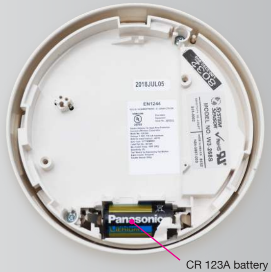
Fig. 1 Smoke detector with back plate removed